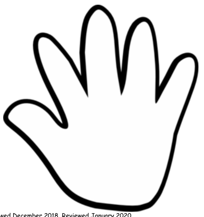
wed December 2018, Reviewed January 2020,

(write on each finger someone you trust)!